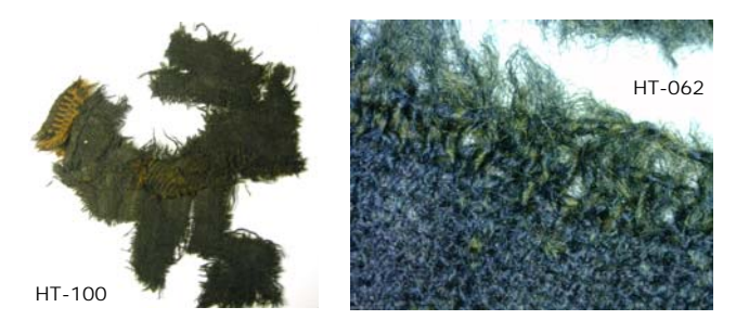
Some textiles in which woad was detected, photographs NHM Wien

In the area of Hallstatt, Austria, a salt mine was exploited since 1600 BC. Due to the conditions of the mine (dry, dark and cold) many objects survived including a large number of textile fragments which are in remarkably good condition. Since 2002, several research projects were carried out to identify the dyes and other materials which colours the textiles. Based on dyestuff analysis of the prehistoric textile samples and archeobotanical literature, it is most likely that woad ( Isatis tinctoria L.) was used in the majority of the dyed samples. The dyeing process with woad is very complicated. The dye itself is not present in the plant material but is formed via fermentation in a vat and bounds to the textile fibre after an oxidation step. It is astonishing that this process was already known more than 3000 years ago.